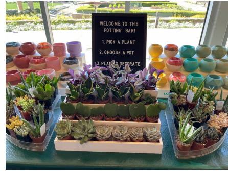
Pita's Planters Party Favors