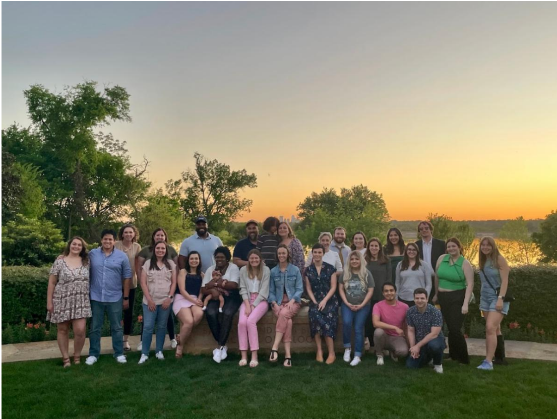
Evening at the Arboretum

What a wonderful evening to celebrate Adolescent and Young Adult (AYA) Awareness Week and get together with friends, family, and loved ones at the Dallas Arboretum. Not only did we get to enjoy the beautiful garden and bask in the sun for a bit, but together, we got to enjoy the evening with a delicious Italian dinner and assortment of desserts. Throughout the event, we were also able to take some fun shots at the photo booth and pick out a small plant to pot and take home with us.