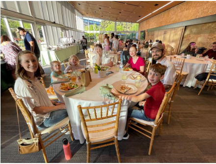
Dinner with a View

Overall, I'm so happy that I got to spend my evening with y'all at the Dallas Arboretum. I truly love my succulent that I got to plant at the event, which is currently thriving and already sprouting in its new home!